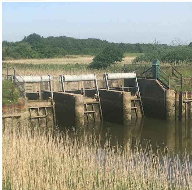
Image: Snape sluice

We will perform various intrusive tests to parts of the sluice structure including to the flap valves, headwall, dividers and sheet pile walls.